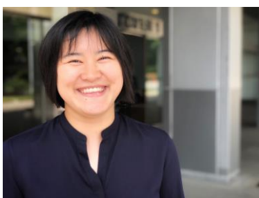
FASS AWARDS RECEIPIENT 2019