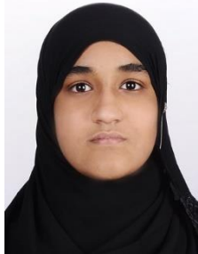
FASS AWARDS RECIPIENT 2019

The prizes were set up in AY2009-2010 to honour the achievements of top students in the Arabic, Chinese, German, Japanese, Korean, Malay, Tamil and Thai language programmes. These prizes are funded by donations. Awardees will be awarded book prizes. The prizes aim to recognize top students who have performed consistently well and to encourage the students to continue with their language learning efforts. The Centre would like to congratulate the following students who have received the award for 2018/2019