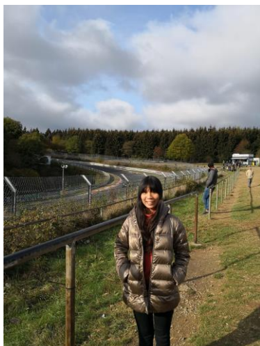
FASS AWARDS RECEIPIENT 2019