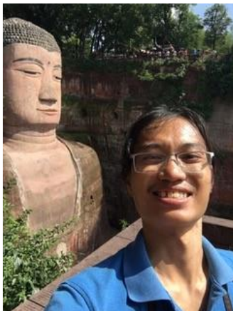
FASS AWARDS RECIPIENT 2019

I am really honoured to receive this award after learning Bahasa Indonesia (BI) for six levels. BI has been an integral part of my university life. They brought me great joy as I loved learning the language, and the many aspects of Indonesian culture. Not only that, I had loving and kind teachers who were really like mothers to me. Although learning a new language is not easy, I looked forward to every class because of my encouraging teachers and friends. I am extremely grateful for all my teachers who continuously supported me throughout this journey. I am happy to say that I left NUS with the knowledge of a new language, and many close friendships from BI classes. Learning BI is undoubtedly the best decision I made in university.