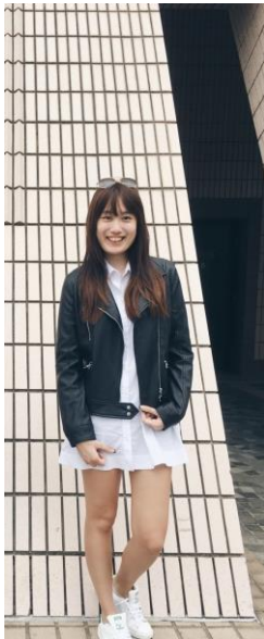
FASS AWARDS RECIPIENT 2019

I looked forward to and enjoyed the Japanese module I took every semester. The teachers were dedicated and encouraging, classes were engaging and well-structured, and my classmates - many of whom became my most intimate NUS friends - were wonderful company. I have made considerable progress since I took LAJ1201 as a freshman and I thank the Japanese programme as well as my course mates and teachers for enabling my growth with their steadfast support. With or without the prize, which I am pleasantly surprised and honoured to receive, I am glad that I chose to learn Japanese and persevered with my decision