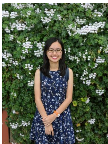
FASS AWARDS RECEIPIENT 2019

I am extremely honoured to receive the CLS German Language Prize. Initially, I took up German because of a mild interest in German music. Eventually, I fell in love with the language and culture, thus deciding to pursue it all the way. My German language journey has opened so many doors for me - giving me the opportunity to attend summer school in Stuttgart as well as an exchange in Mannheim. Learning German was one of the best parts of my NUS life. It has been a fulfilling experience for me as I made many friends in German classes and even connected with German-speaking students both abroad and back in Singapore. I am immensely grateful to my patient and encouraging teachers for going the extra mile in helping me grow. When I first visited Germany after learning German 1, I could barely form basic sentences while communicating with my host family. After 2 years of classes, I visited my host family again and was pleasantly surprised that I could converse completely in German with them. That was heartening and made me appreciate the intimate connections that speaking a foreign language allows us to form. Although German 6 is over, I am learning German Studies as a guest student and will continue to improve my language skills from here.