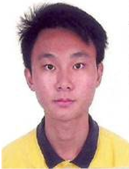
FASS AWARDS RECIPIENT 2022