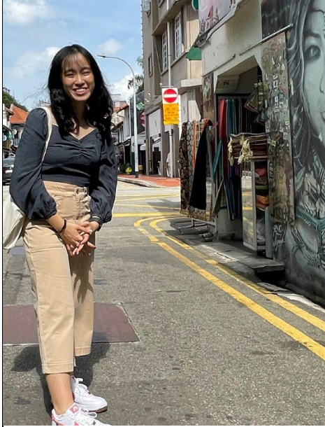
FASS AWARDS RECIPIENT 2022