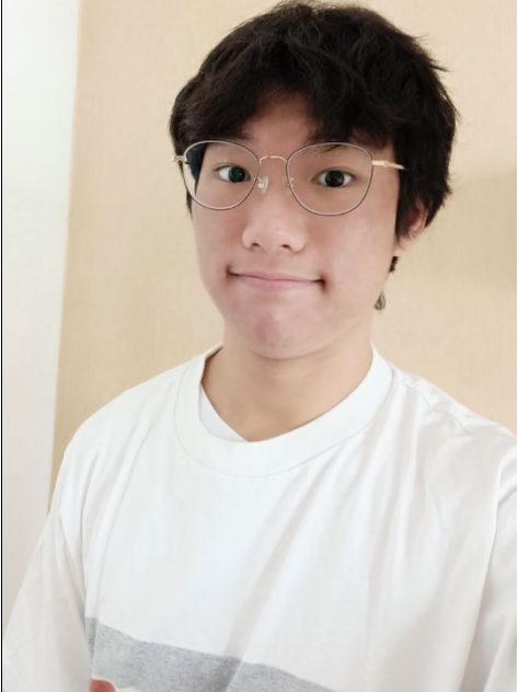
FASS AWARDS RECIPIENT 2022

Thank you, CLS for the award and I am inspired to continue learning the language and engaging with Malay speakers.