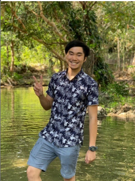
FASS AWARDS RECEIPIENT 2022

Having Arab ancestry myself, I've always wanted to learn Arabic in my bid to reconnect with a part of my heritage. With this prize, the opportunity provided to me by NUS serves as a reminder of my endeavours in learning the language and expanding my Arabic further beyond my university life.