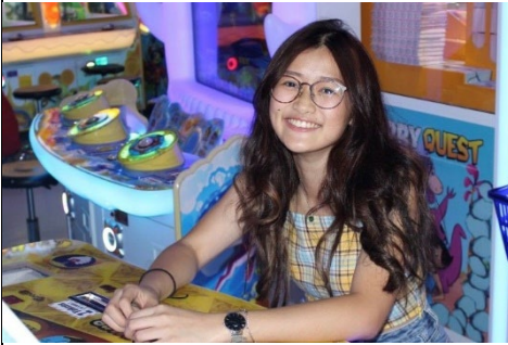
FASS AWARDS RECIPIENT 2022