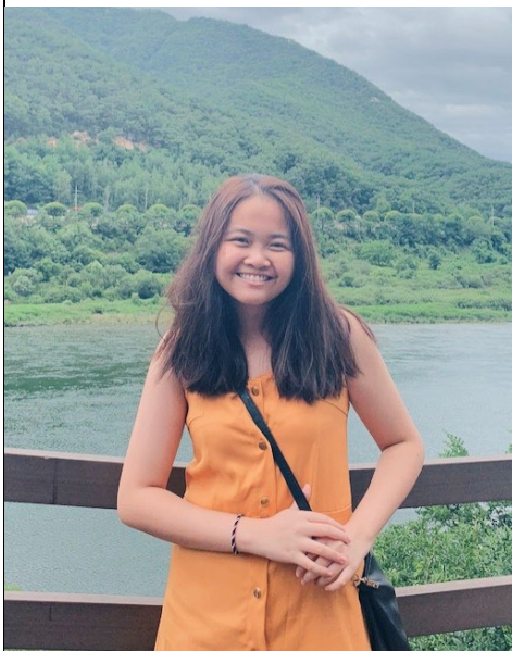
FASS AWARDS RECIPIENT 2022

Learning Japanese has become a truly unforgettable part of my university life, and this award will always remind me to strive for the better.