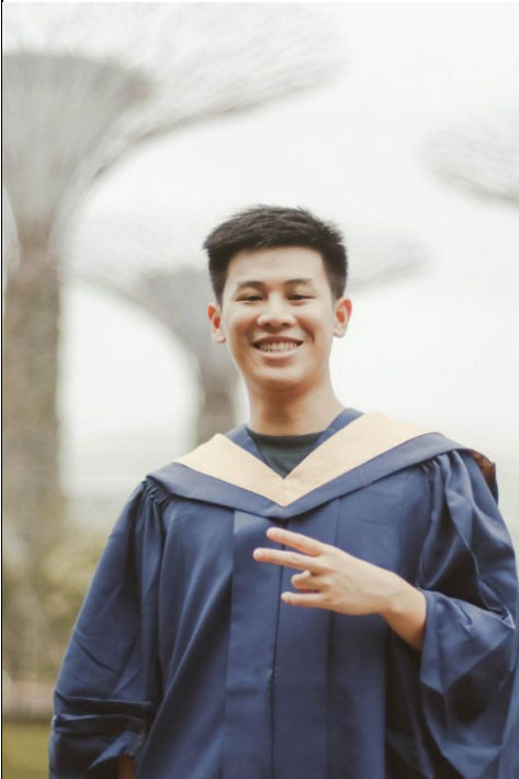
FASS AWARDS RECIPIENT 2022