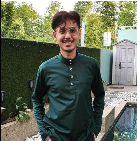
FASS AWARDS RECEIPIENT 2022

The prizes were set up in AY2009/2010 to honour the achievements of top students in the Arabic, Bahasa Indonesia, Chinese, German, Hindi, Japanese, Korean, Malay, Tamil and Thai language programmes. These prizes are funded by donations. Awardees will be awarded cash prizes. The prizes aim to recognize top students who have performed consistently well and to encourage the students to continue with their language learning efforts. The Centre would like to congratulate the following students who have received the award for 2021/2022.