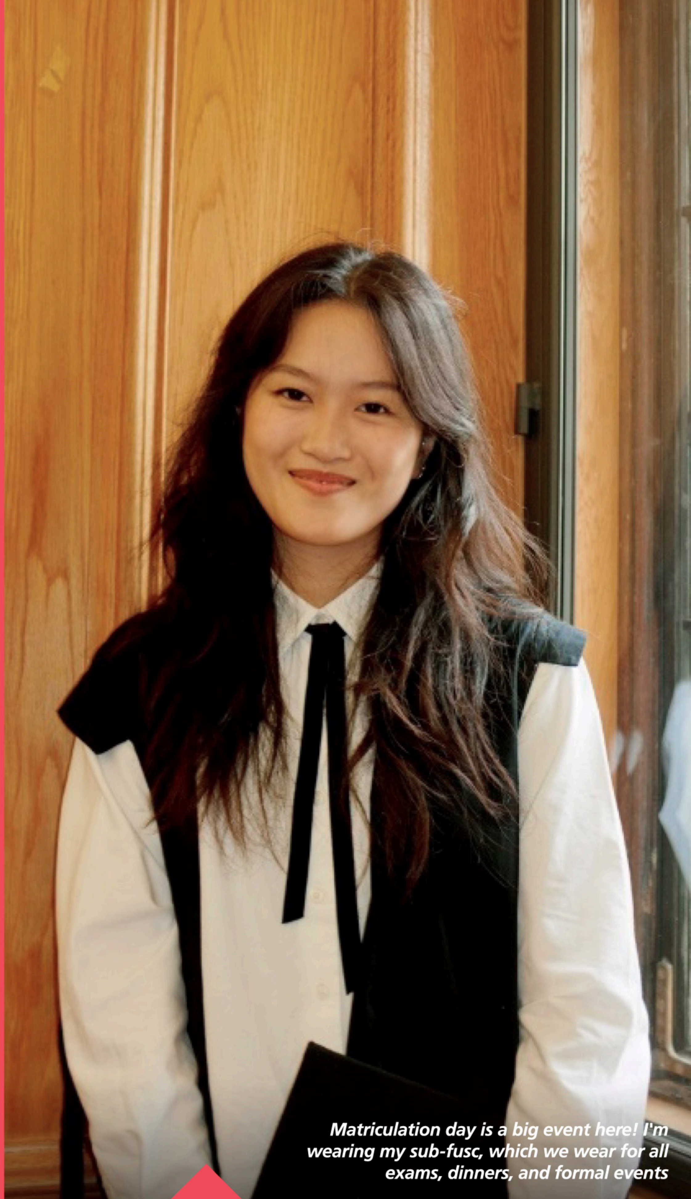
Matriculation day is a big event here! I'm wearing my sub-fusc, which we wear for all exams, dinners, and formal events