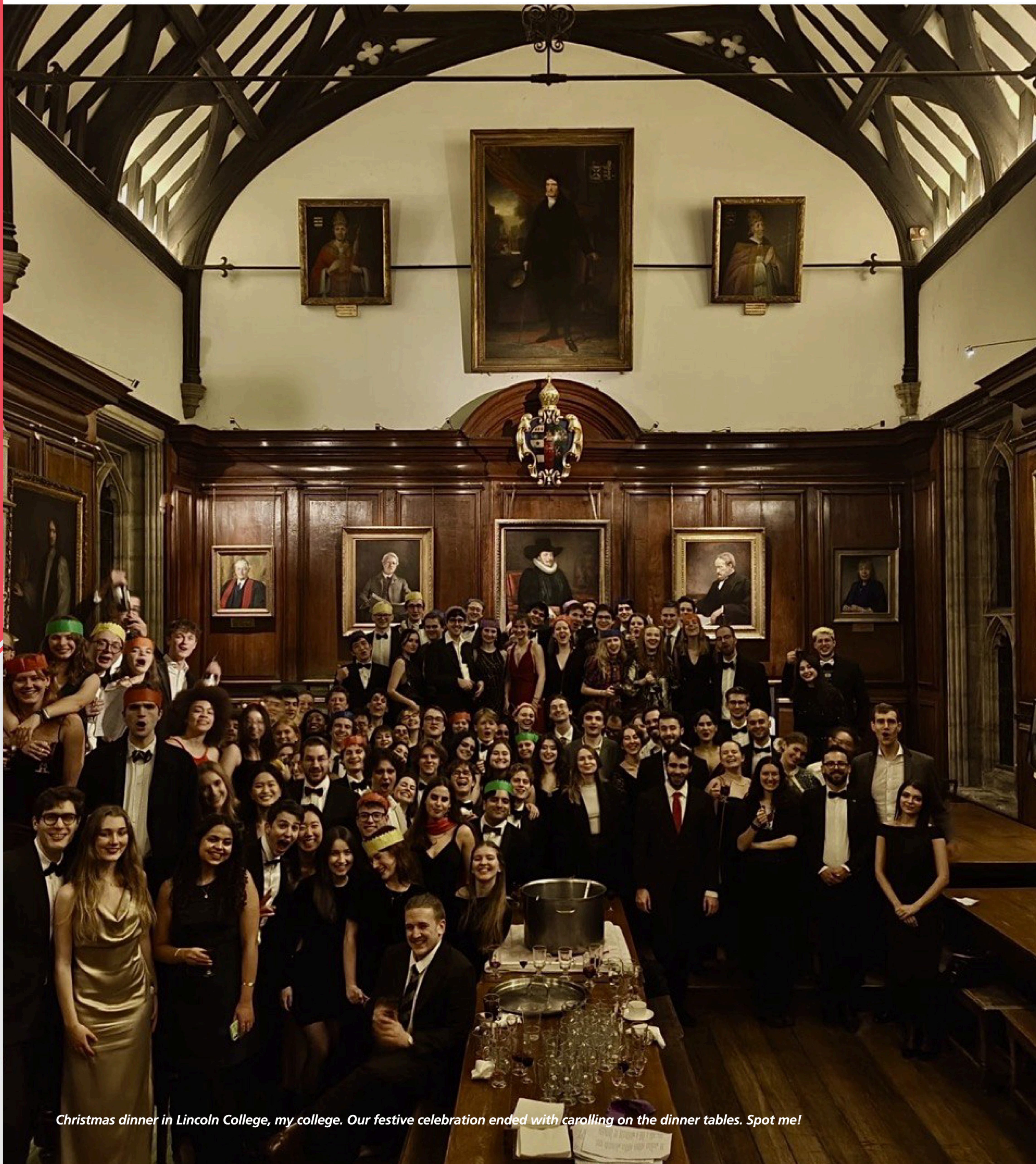
Christmas dinner in Lincoln College, my college. Our festive celebration ended with carolling on the dinner tables. Spot me!